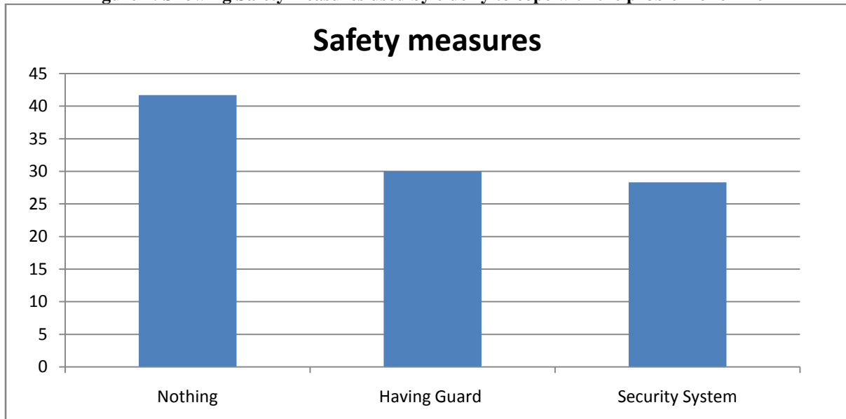
Figure 2: Showing Safety measures used by elderly to cope with the problem of crime